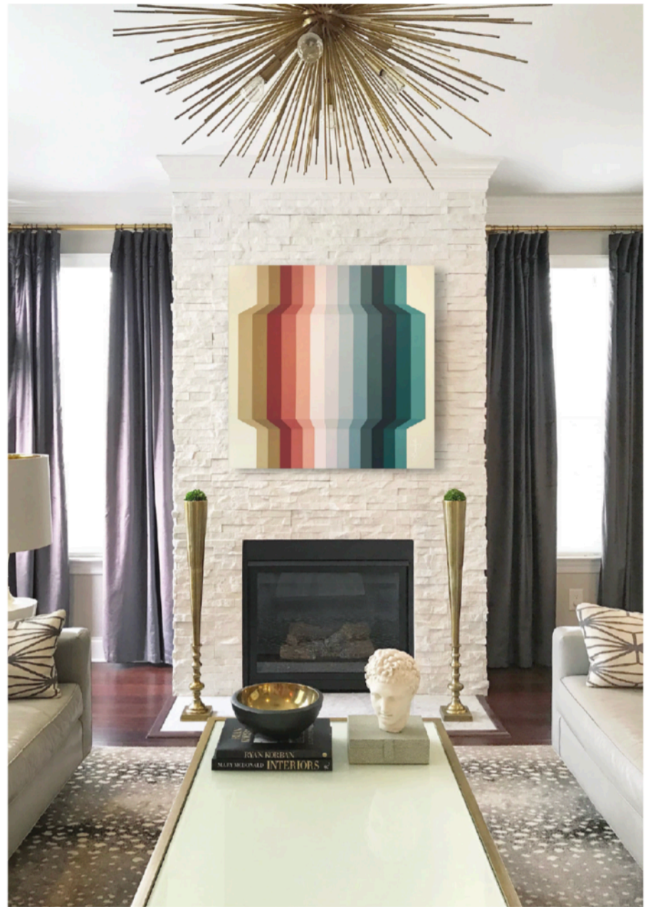
Gina Julian Acrylic painting

The art world is constantly growing and transforming, inviting us to explore and embrace its ever-changing hues, shapes, and textures. Let's enjoy this new landscape of creativity and artistic expression!